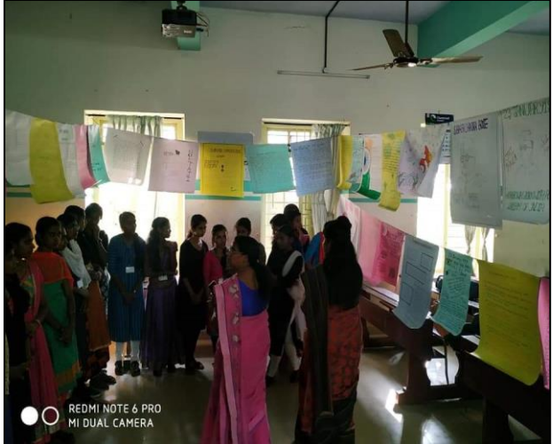
Principal inaugurating the event.....