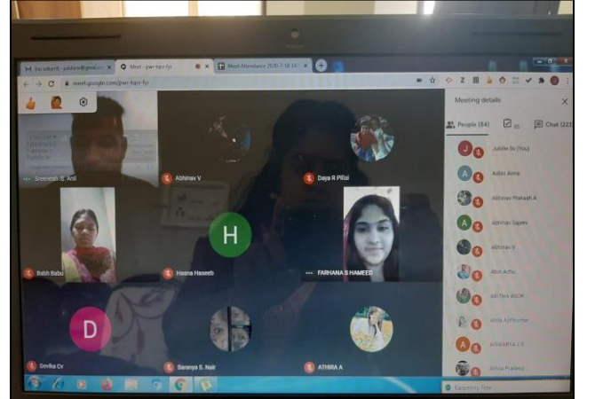
Inauguration by principal.....